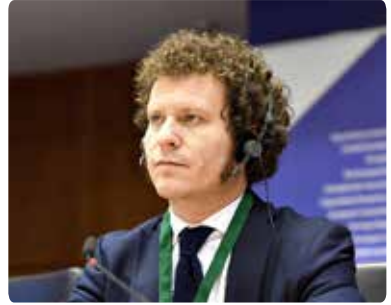
Matteo Bianchi MP