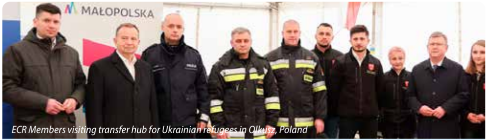
ECR Members visiting transfer hub for Ukrainian refugees in Olkusz, Poland