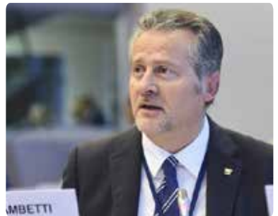
ECR Bureau Member Roberto Ciambetti

→ European Health Union: Reinforcing the EU’s resilience – Roberto Ciambetti. The opinion looks at ways to enhance local and regional authorities in a “European health union” . The principle of subsidiarity is referred to several times in the opinion and for the rapporteur it proves to be an essential operational principle of reference. “We need to have more public investments in national health systems to ensure that they have the resources and means they need to emerge from the current crisis, as well as to strengthen their resilience in the long term”.