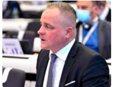
ECR Vice-President Juraj Droba

→ Effectively engaging local and regional authorities in the preparation of the Partnership Agreements and Operational Programmes for the 2021-2027 period - Juraj Droba. The opinion looks at ways to improve regional participation in the cohesion policy programmes for the 2021-27 period. In order to ensure that cohesion policy successfully meets citizens' needs on the ground, the full involvement of local and regional authorities, socio-economic partners and civil society at all stages of the preparation and implementation of these key documents is of paramount importance. “The regional dimension and solid data are often missing in the debates between governments and the European Commission. Therefore, the voice of the regions and cities must be strengthened.”