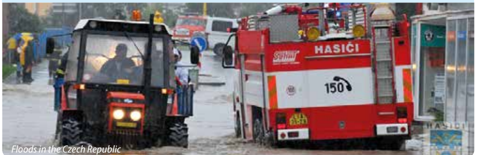
Floods in the Czech Republic

The CoR opinion on “Territorial Vision 2050: What future?” by our rapporteur Oldřich Vlasák helped feed into the Member States debate on the future of EU territorial policies. As a result, a stronger territorial dimension is already in the programming for the next post-2020 period.