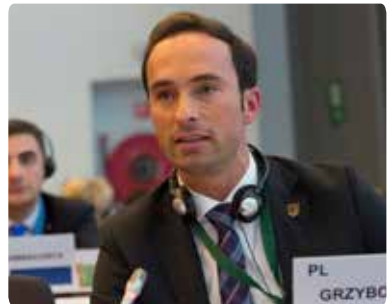
Mayor Paweł Grzybowski