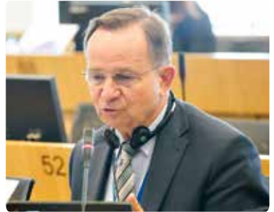
ECR First Vice Presidents Władysław Ortyl

→ The future of regional airports – Challenges and opportunities – Władysław Ortyl. The opinion looks at ways to expand the financial support to the airports. Indeed, in October 2020, nearly 200 airports in Europe were facing insolvency. Their bankruptcy would have a dramatic impact on employment and the economies of the regions. “Regional airports play a crucial role for the territorial and economic cohesion of the EU – they provide connectivity for the regions they serve and are vital for economic growth. Without their presence, many companies would not invest in non-capital regions.”