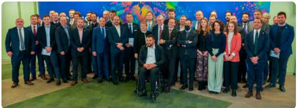
ECR Localism Summit in Drenthe in the Netherlands, November 2021