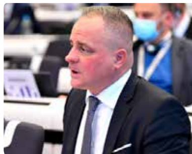
ECR Vice-President Juraj Droba

The opinion looks at ways to improve regional participation in the cohesion policy programmes for the 2021-27 period. In order to ensure that cohesion policy successfully meets citizens' needs on the ground, the full involvement of local and regional authorities, socio-economic partners and civil society at all stages of the preparation and implementation of these key documents is of paramount importance. “The regional dimension and solid data are often missing in the debates between governments and the European Commission. Therefore, the voice of the regions and cities must be strengthened.”