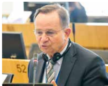
ECR First Vice Presidents Władysław Ortyl

The opinion looks at ways to expand the financial support to the airports. Indeed, in October 2020, nearly 200 airports in Europe were facing insolvency. Their bankruptcy would have a dramatic impact on employment and the economies of the regions. “Regional airports play a crucial role for the territorial and economic cohesion of the EU – they provide connectivity for the regions they serve and are vital for economic growth. Without their presence, many companies would not invest in non-capital regions.”