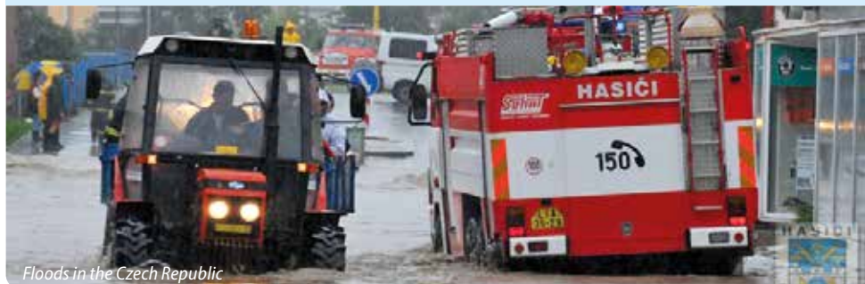
Floods in the Czech Republic

The CoR opinion on “ Territorial Vision 2050: What future? ” by our rapporteur Oldřich Vlasák helped feed into the Member States debate on the future of EU territorial policies. As a result, a stronger territorial dimension is already in the programming for the next post-2020 period.