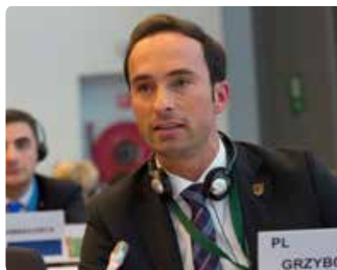
Mayor Paweł Grzybowski