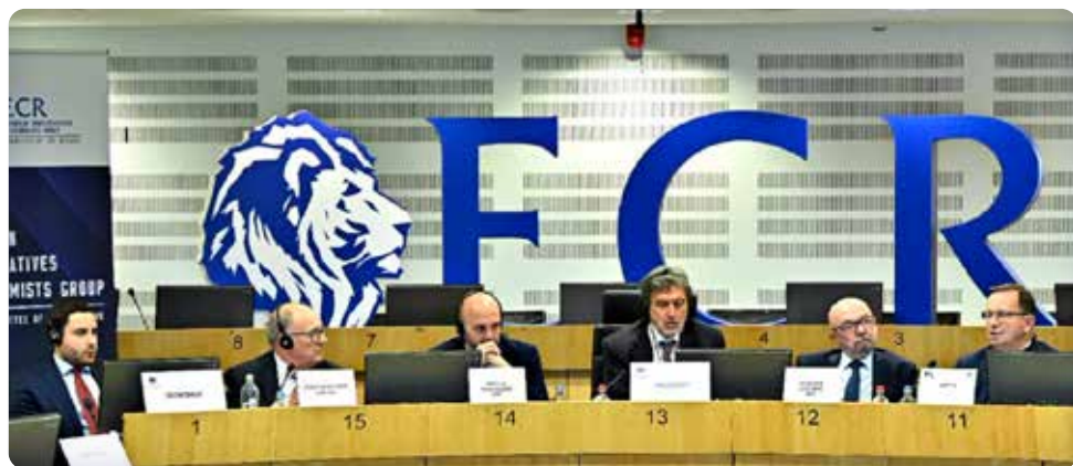
Co-chairmen of the ECR Group in the European Parliament, Professor Ryszard Legutko and Nicola Procaccini at the ECR Group meeting in Brussels, May 2023

The ECR Group in the CoR is a partner of the ECR Party, which continues to grow with a respectable number of MEPs, prime ministers in the European Council and a successful think tank.