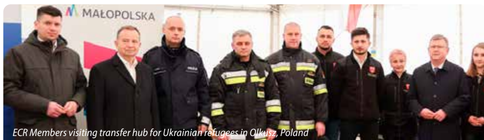
ECR Members visiting transfer hub for Ukrainian refugees in Olkusz, Poland