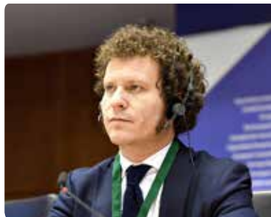
Matteo Bianchi MP