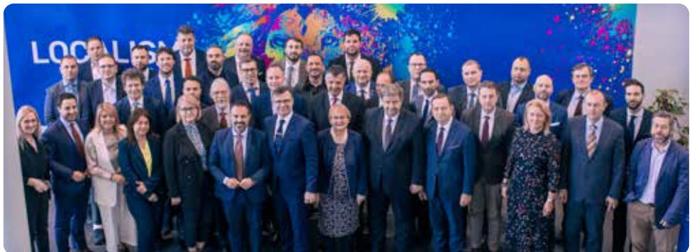
ECR Localism Summit in Lappeenranta, Finland, May 2023