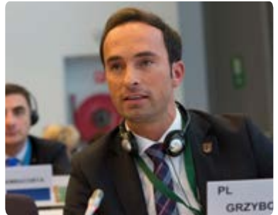
Mayor Paweł Grzybowski