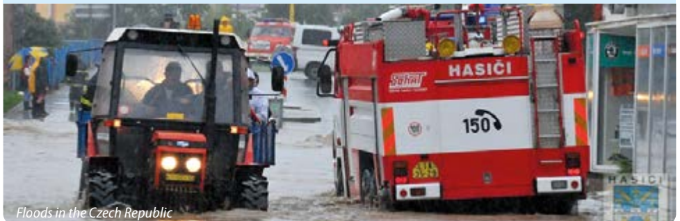
Floods in the Czech Republic

The CoR opinion on “Territorial Vision 2050: What future?” by our rapporteur Oldřich Vlasák helped feed into the Member States debate on the future of EU territorial policies. As a result, a stronger territorial dimension is already in the programming for the next post-2020 period.