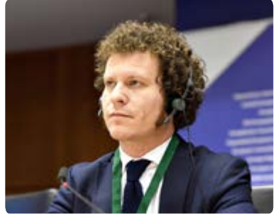
Matteo Bianchi MP