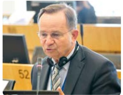
ECR First Vice Presidents Władysław Ortyl

→ The future of regional airports – Challenges and opportunities – Władysław Ortyl. The opinion looks at ways to expand the financial support to the airports. Indeed, in October 2020, nearly 200 airports in Europe were facing insolvency. Their bankruptcy would have a dramatic impact on employment and the economies of the regions. “Regional airports play a crucial role for the territorial and economic cohesion of the EU – they provide connectivity for the regions they serve and are vital for economic growth. Without their presence, many companies would not invest in non-capital regions.”