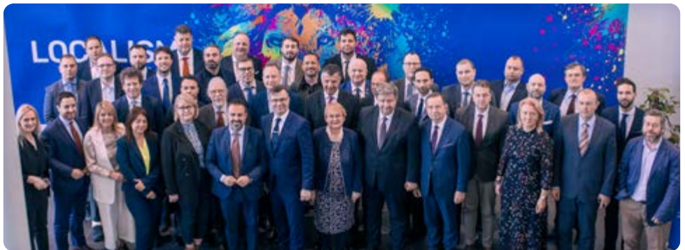
ECR Localism Summit in Lappeenranta, Finland, May 2023