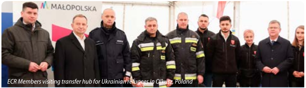
ECR Members visiting transfer hub for Ukrainian refugees in Olkusz, Poland