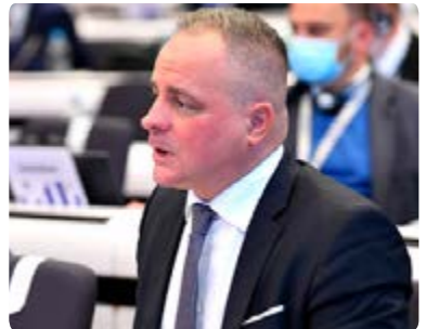
ECR Vice-President Juraj Droba

→ Effectively engaging local and regional authorities in the preparation of the Partnership Agreements and Operational Programmes for the 2021-2027 period - Juraj Droba. The opinion looks at ways to improve regional participation in the cohesion policy programmes for the 2021-27 period. In order to ensure that cohesion policy successfully meets citizens' needs on the ground, the full involvement of local and regional authorities, socio-economic partners and civil society at all stages of the preparation and implementation of these key documents is of paramount importance. “The regional dimension and solid data are often missing in the debates between governments and the European Commission. Therefore, the voice of the regions and cities must be strengthened.”